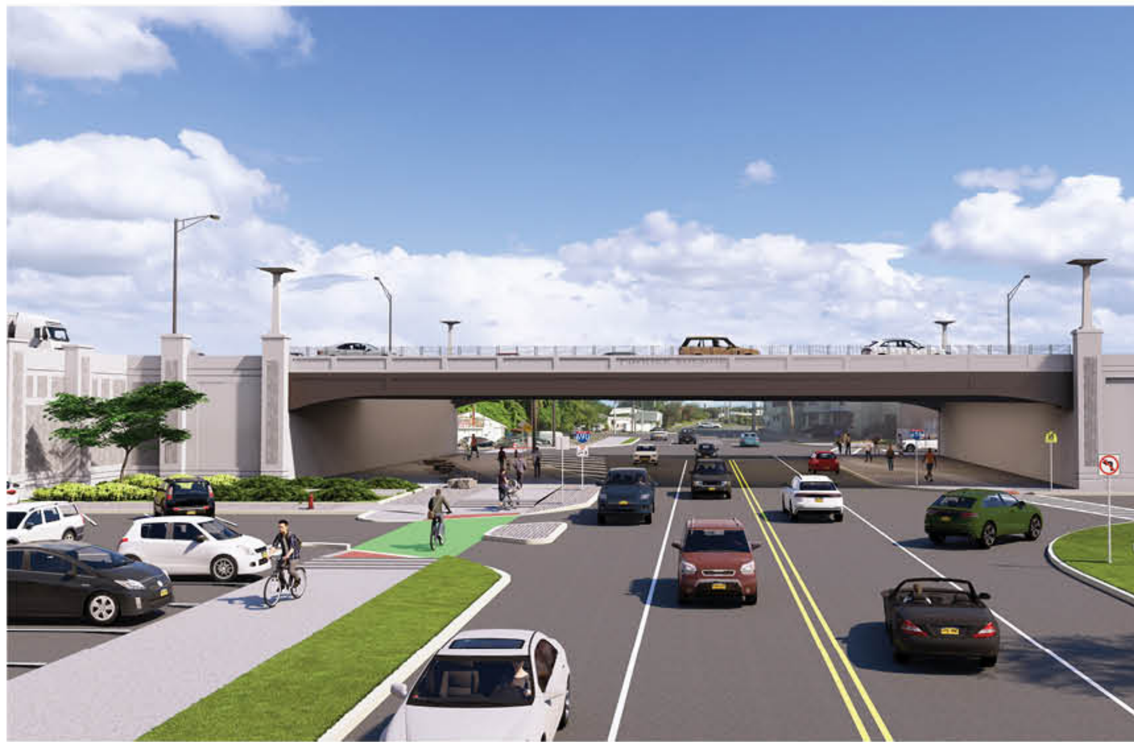
Crouse Avenue bridge from the south