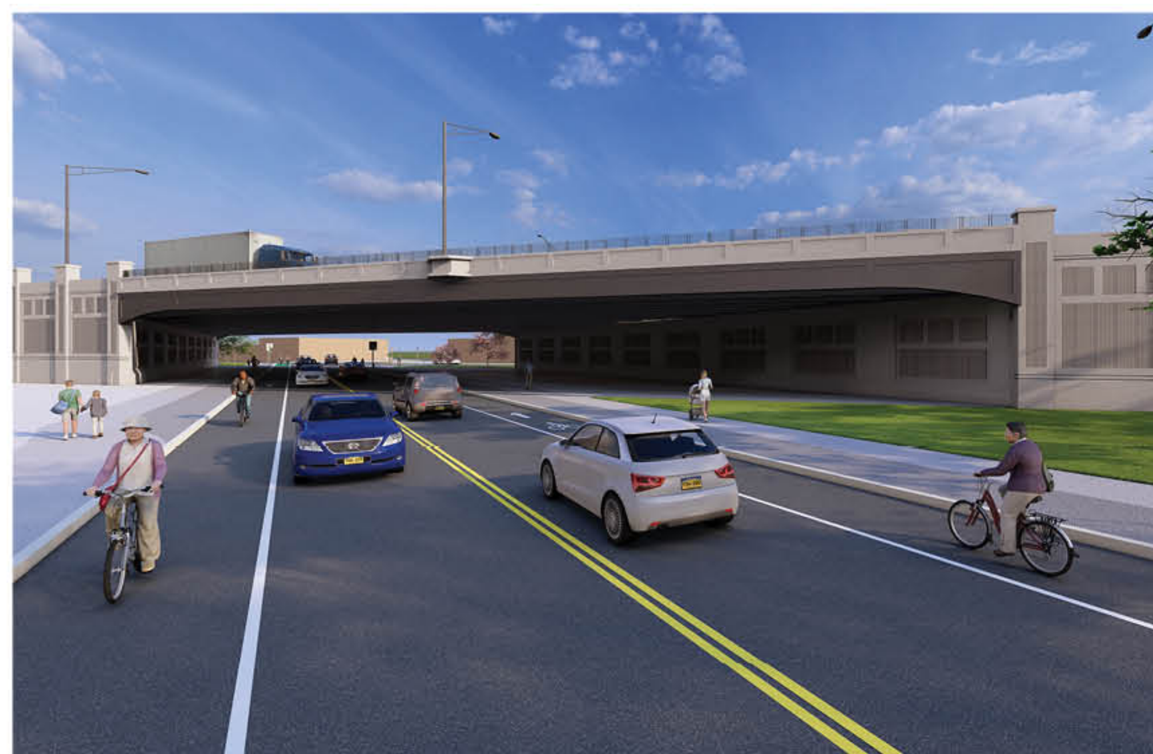
Lodi Street bridge from the north