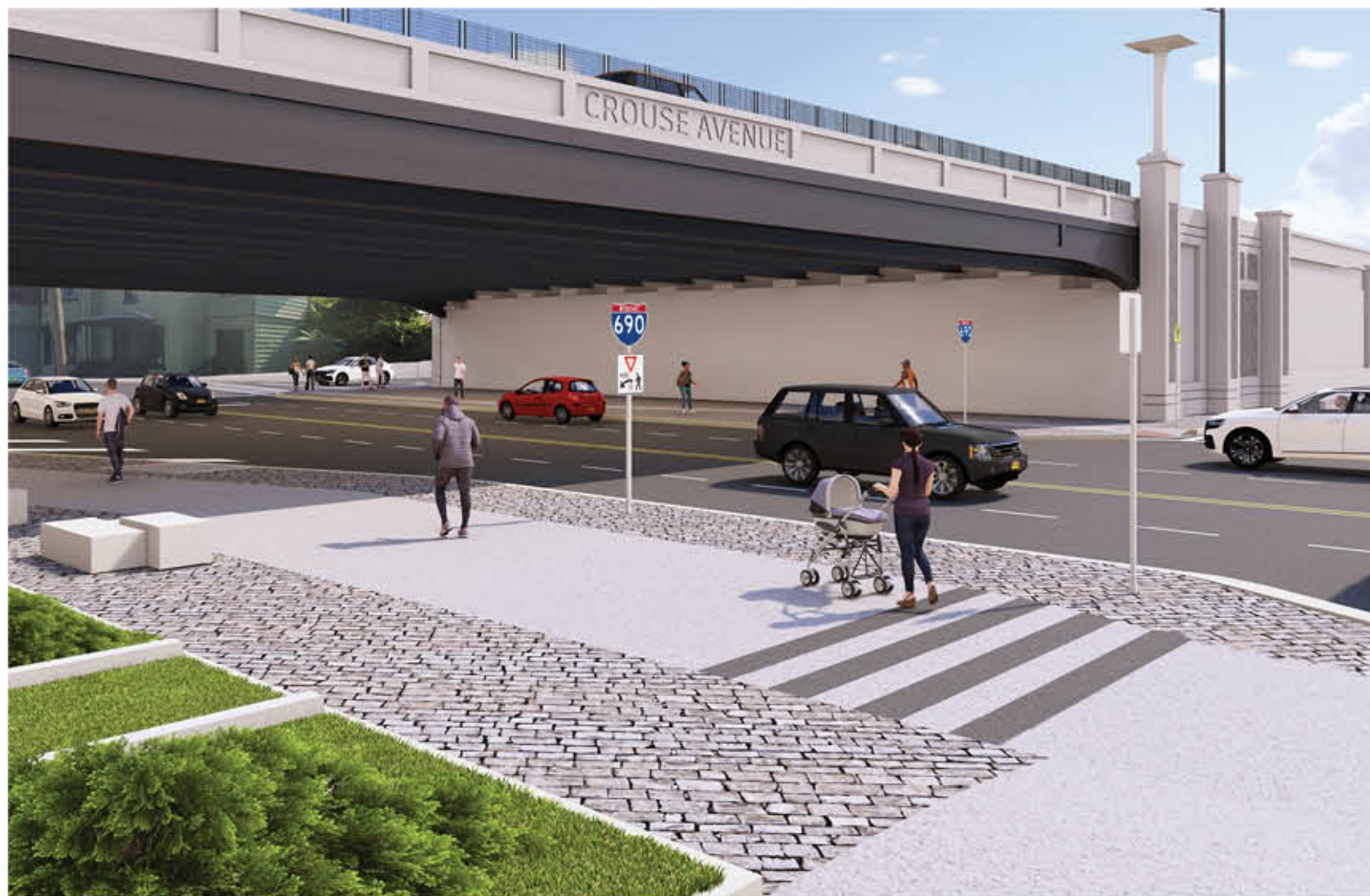
Crouse Avenue underpass and shared use path