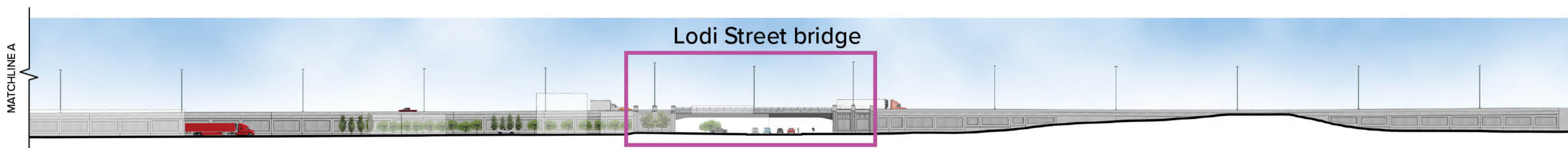
South-facing wall from Irving Avenue to Lodi Street

To be constructed under future Contract 6