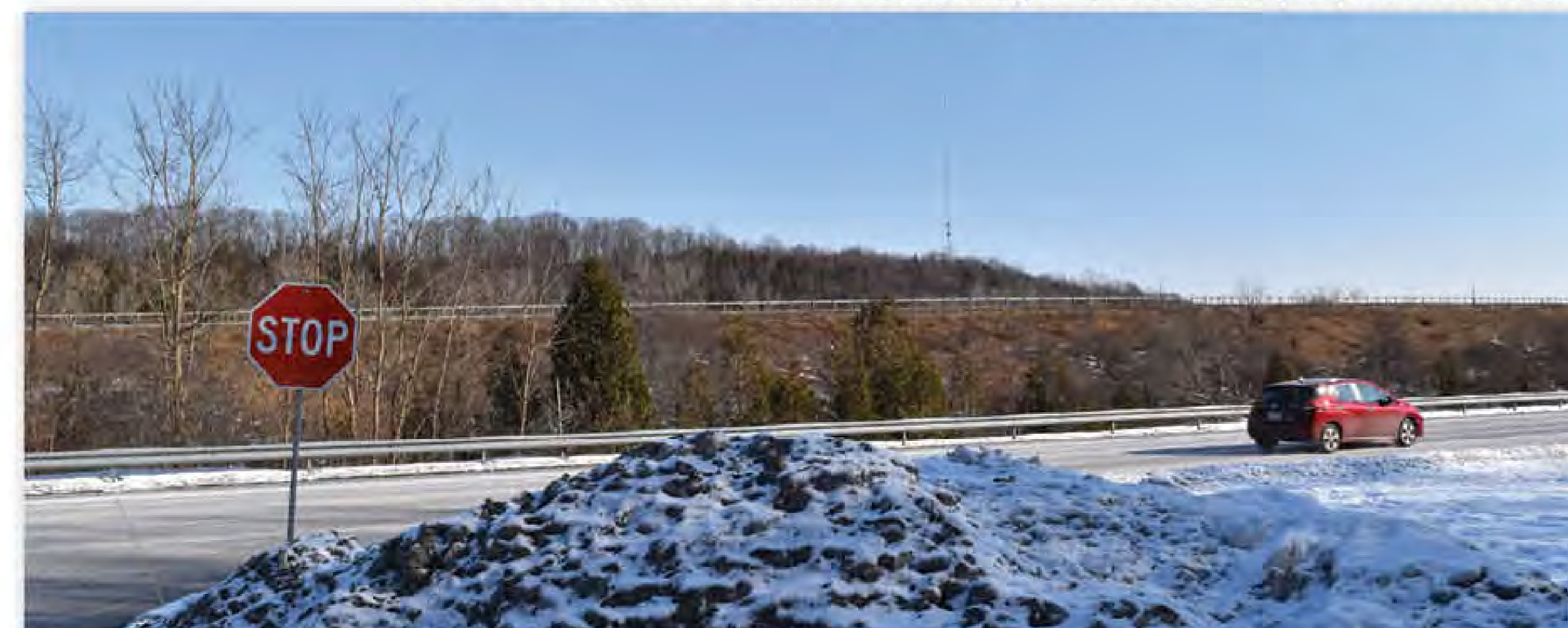
View west toward Cliffside Community entrance and proposed Barrier 9