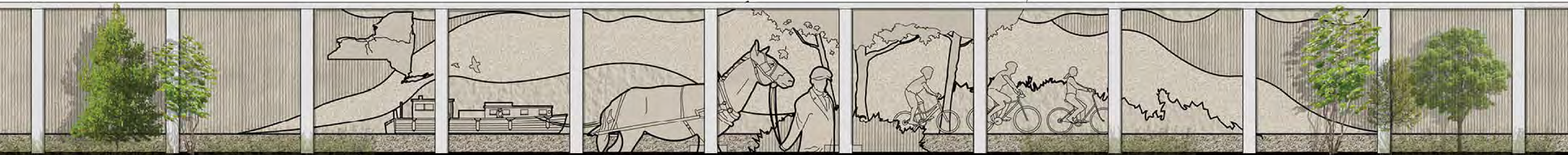
Empire State Trail Theme / Erie Canal Theme (conceptual sketch)