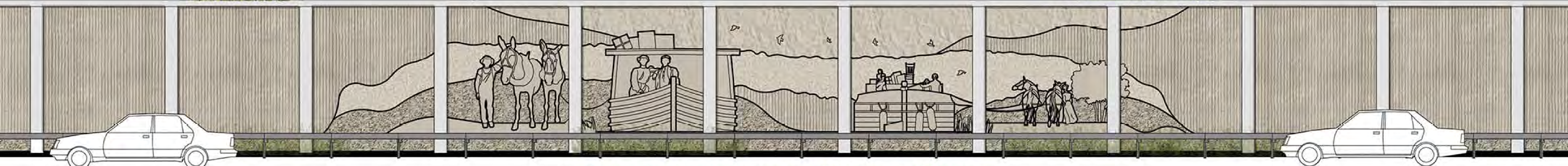
Butternut Creek Aqueduct / Erie Canal Theme (conceptual sketch)

Located between SB I-81 and the Empire State Trail near the route of the old Erie Canal, noise barrier 7B will have a mural on each side in the locations shown to the left. The historical themes of the mural designs are inspired by the Canal, Butternut Creek Aqueduct, and Empire State Trail.