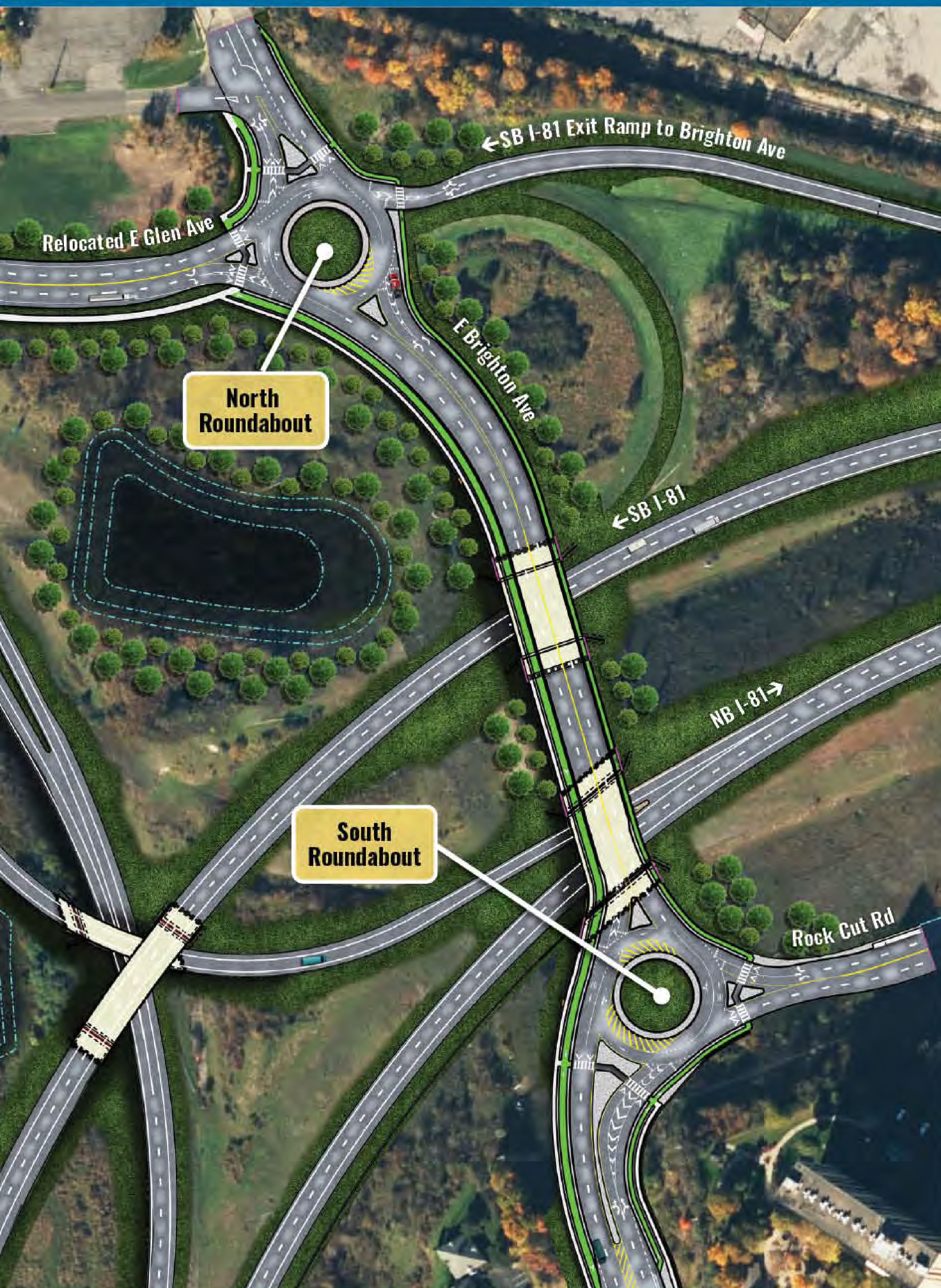
Future South Roundabout ▼