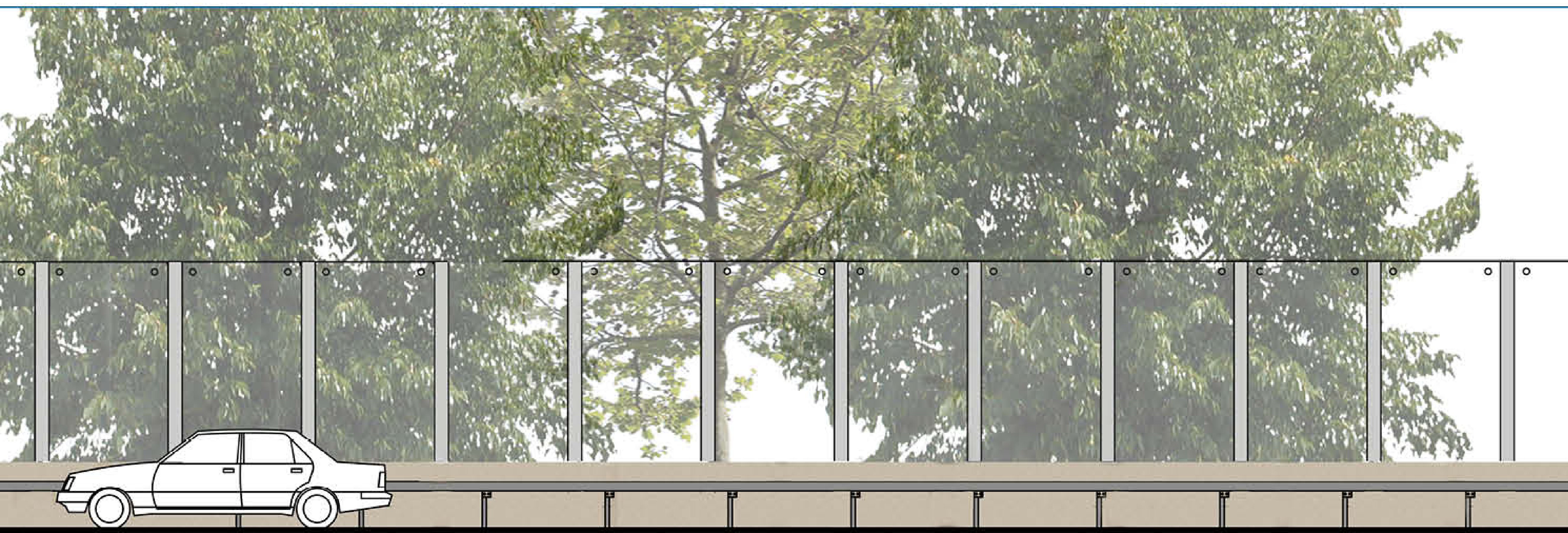
Transparent acrylic wall adjacent to Bear Trap Creek Trail and SB BL 81 bridge over Church Street (conceptual sketch)