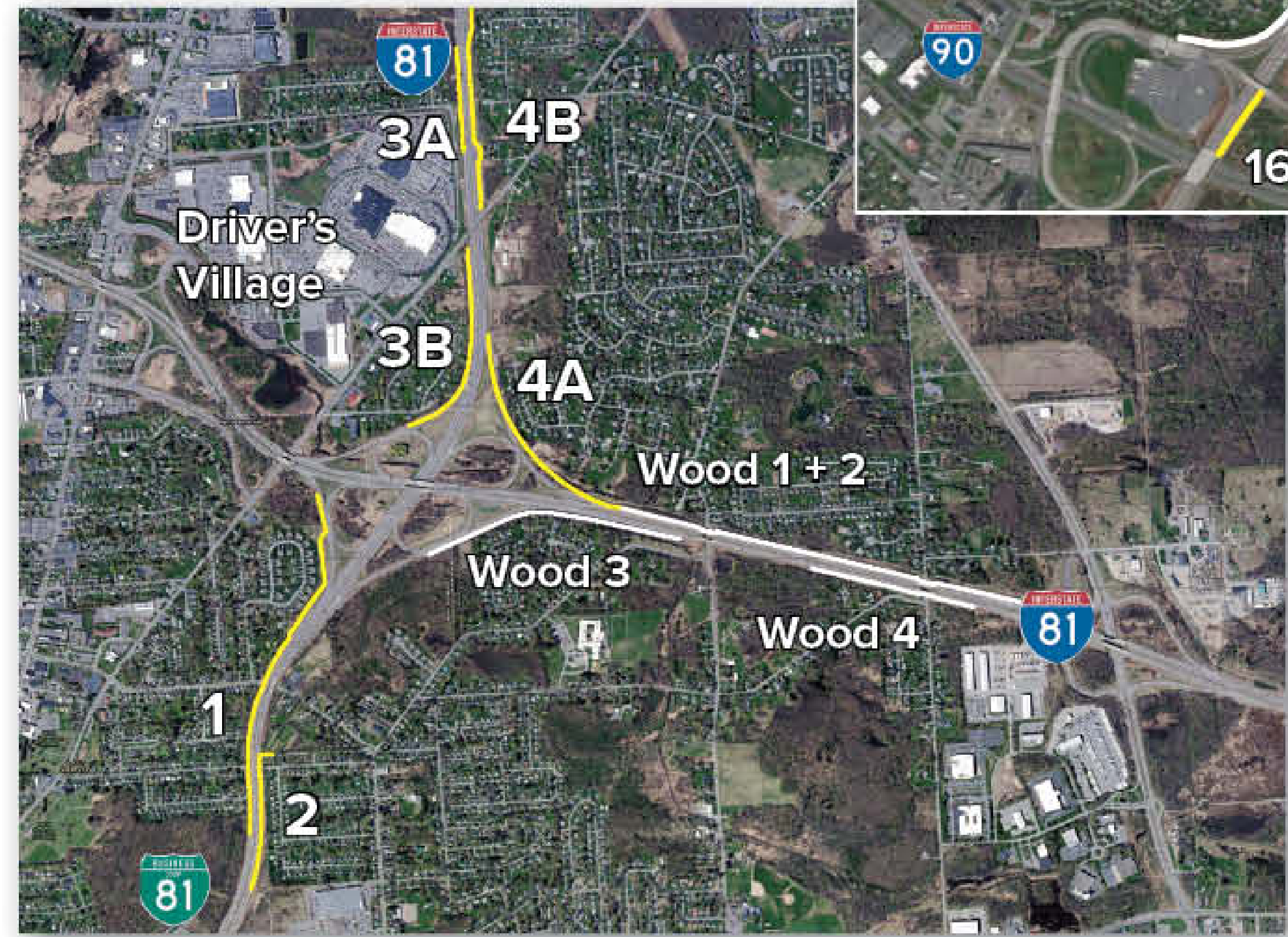
Left: Wooden walls shown here will be replaced by new concrete walls