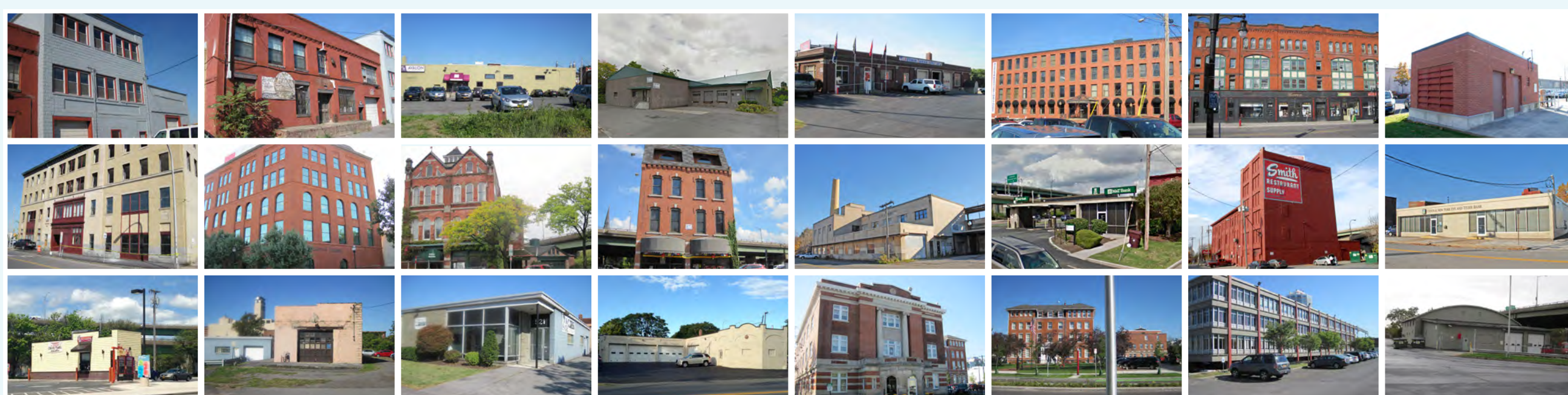
Buildings Acquisitions: 24