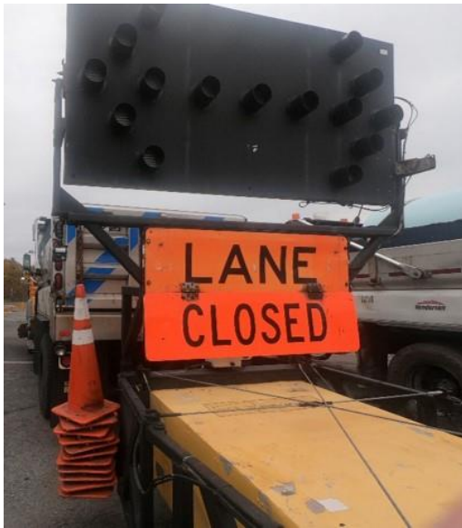
FIG-4 : METHODS OF MOUNTING SIGNS OTHER THAN ON ON POSTS