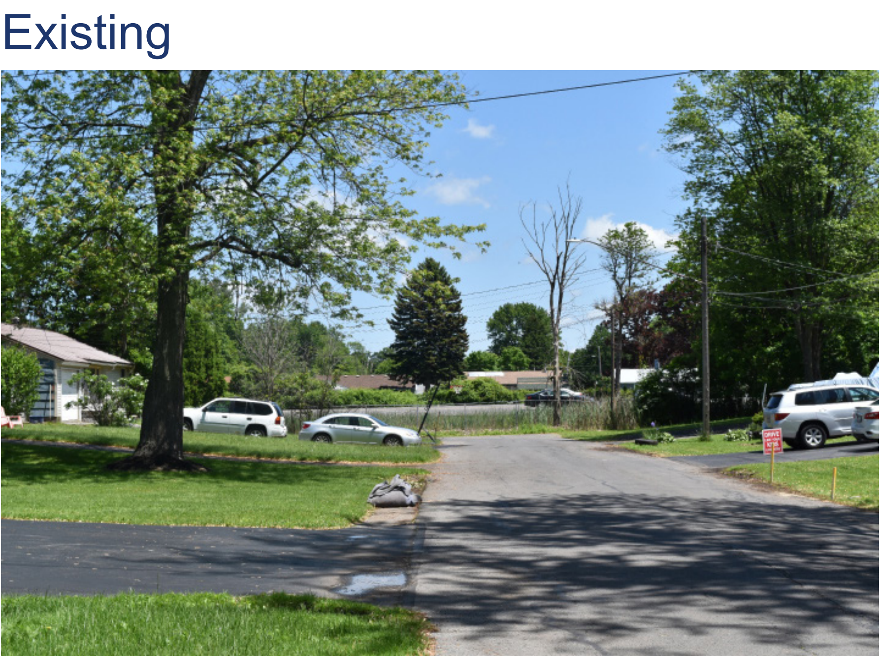
Simulation at Oakley Drive, near its intersection with Wells Avenue