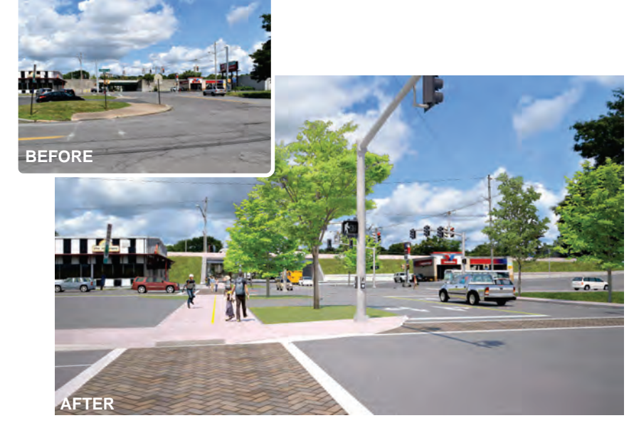
Crouse Avenue Looking North at Water Street