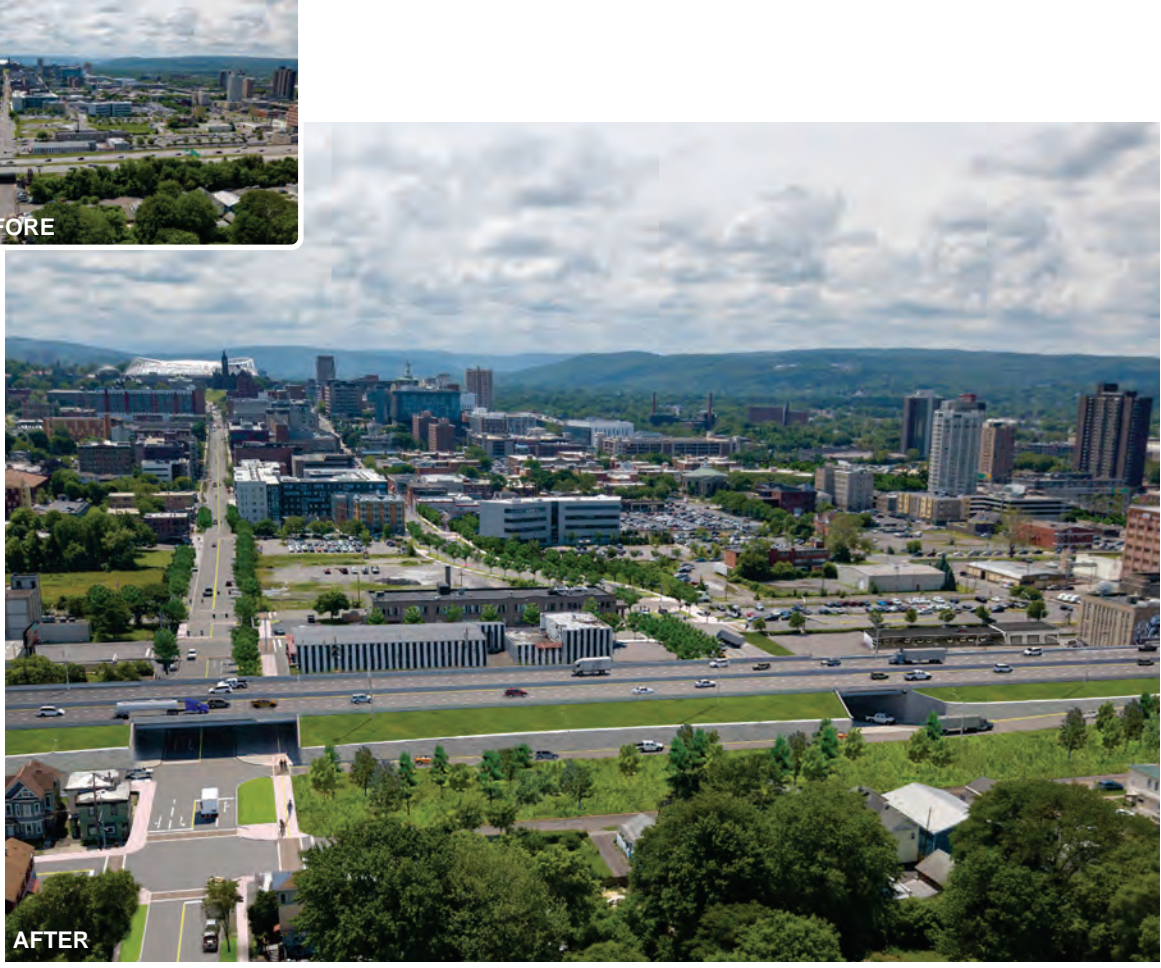
Aerial View of Proposed Crouse Ave and Irving Ave Looking South