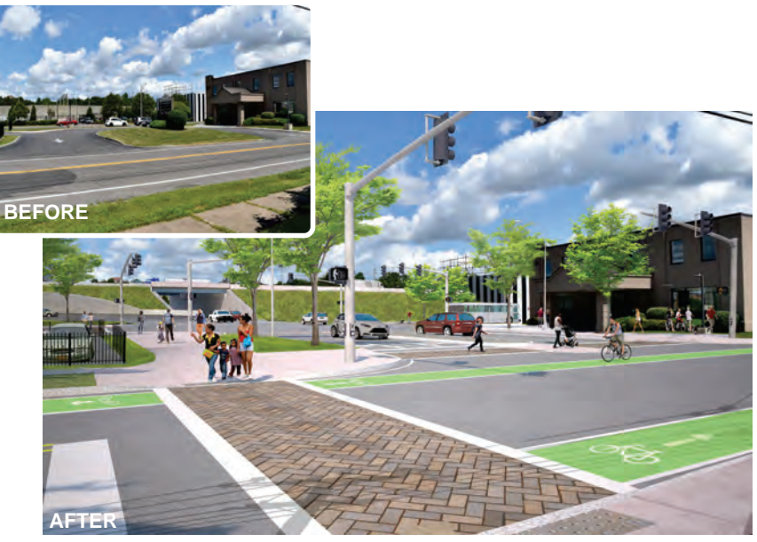
Irving Avenue Looking North at Water Street

Aerial View of Proposed Irving Avenue and Water Street and Erie Boulevard