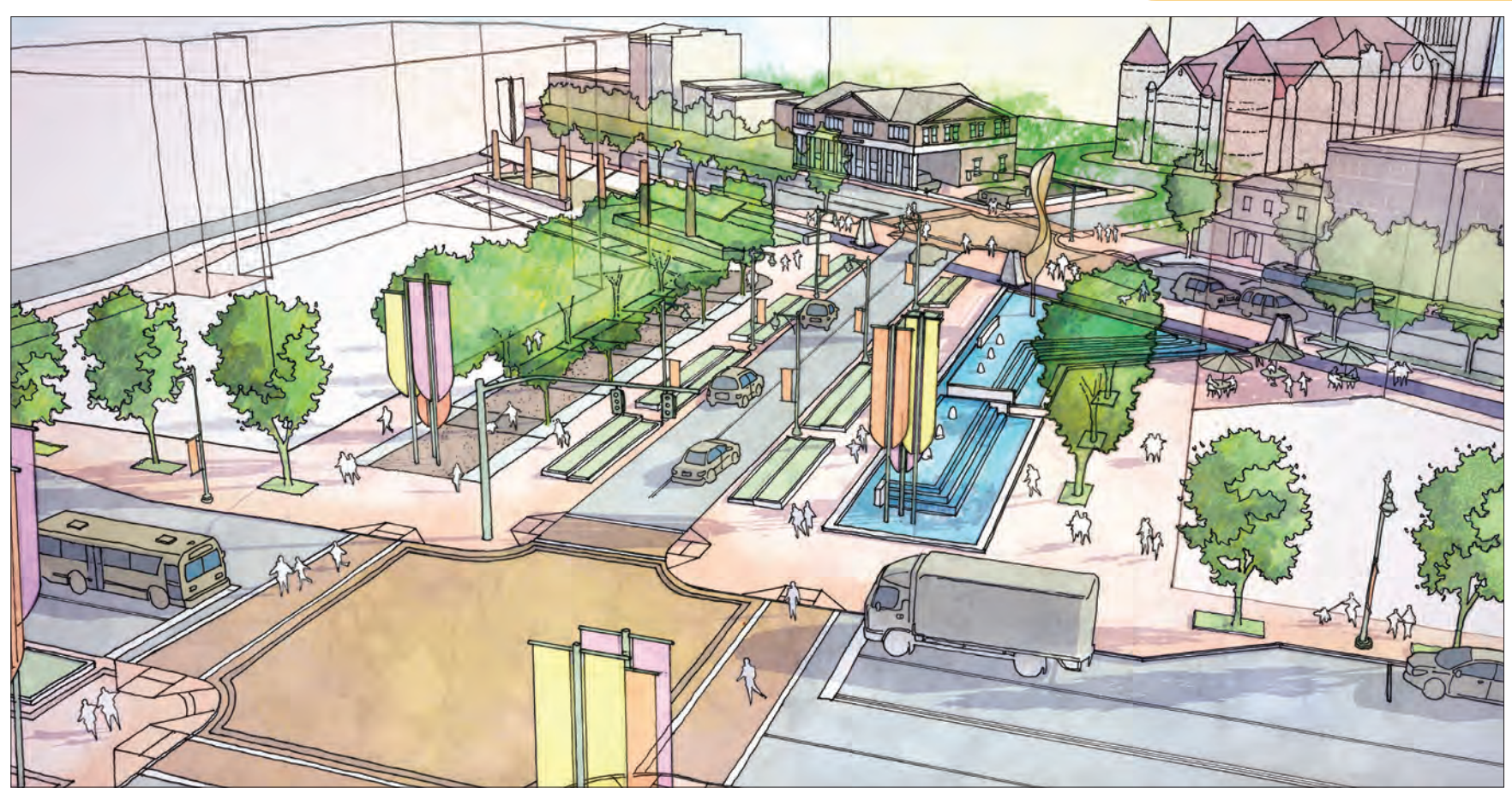
View over the James Street and Oswego Boulevard intersection looking southeast toward the Erie Canal Museum